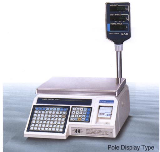
Pole Display Type